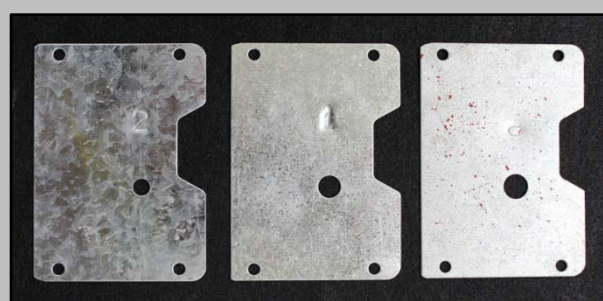
Fig. 1. Herd® spreader blocking plates: #2 (left image), #1 (center image), and #0 (right image). The center hole is where bait drops from the spreader. The four outer holes are used to position the blocking plate on the spreader. The #2 has the smallest diameter hole at 0.28 in (7 mm), followed by the #1 at 0.35 in (9 mm) and the #0 at 0.39 in (10 mm).